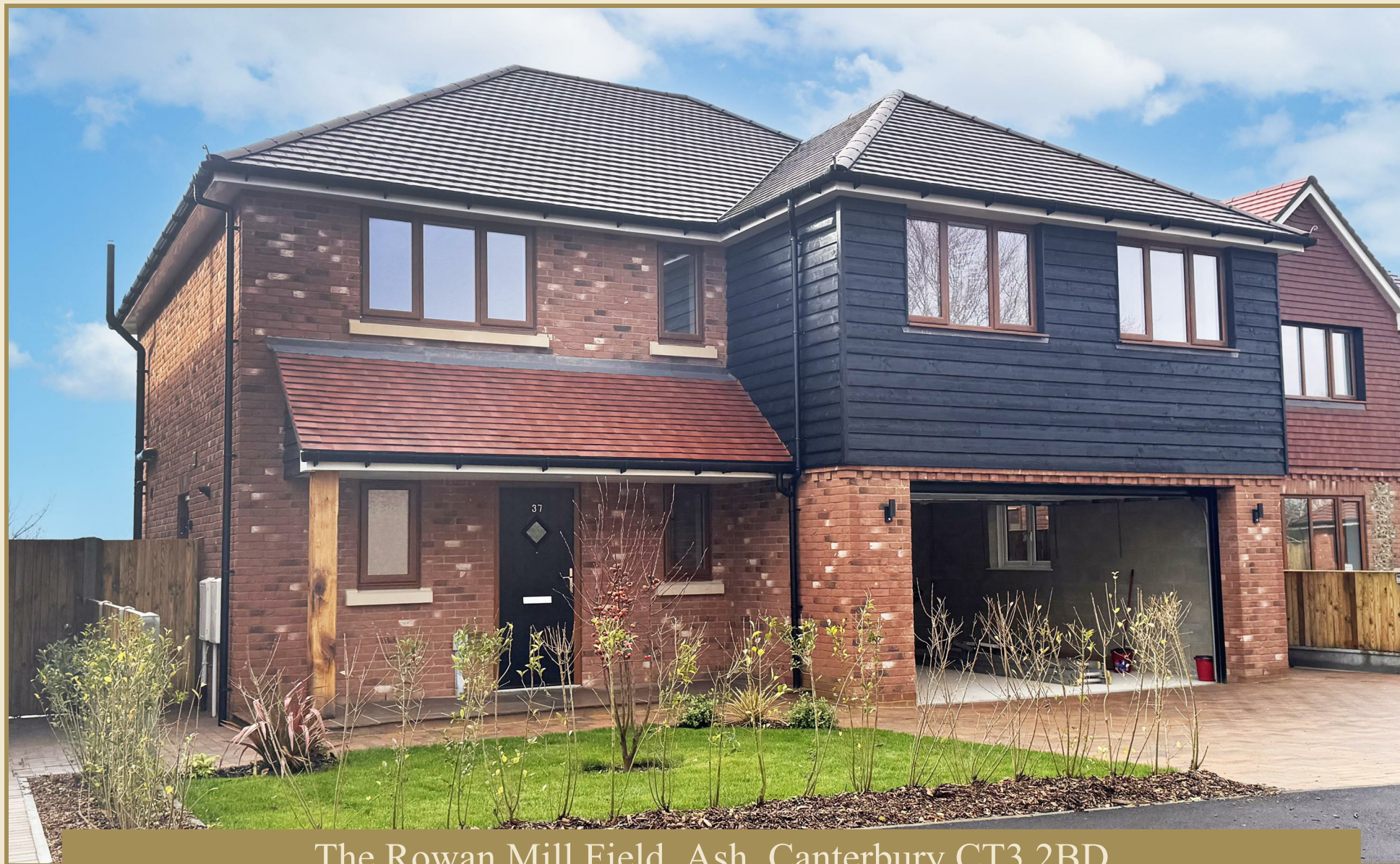
The Rowan Mill Field, Ash, Canterbury CT3 2BD